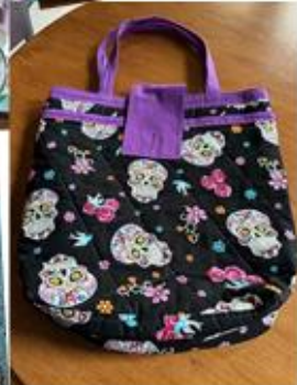
Just a tiny sample of some of our Silent Auction items.