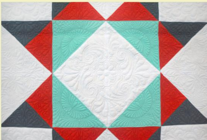
SEEING MISSOURI STARS BRIAN DERBY 2021