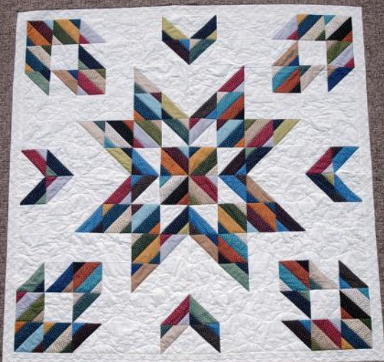
BRIAN DERBY 2021